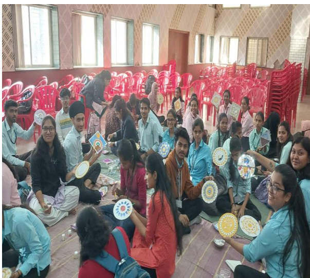
Lippon art made by students