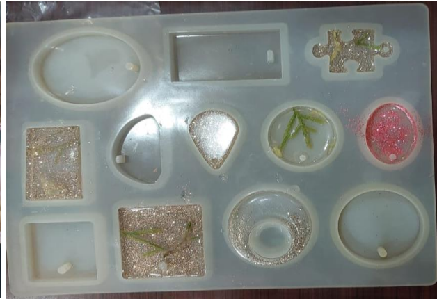
Resin Key Chains made by students